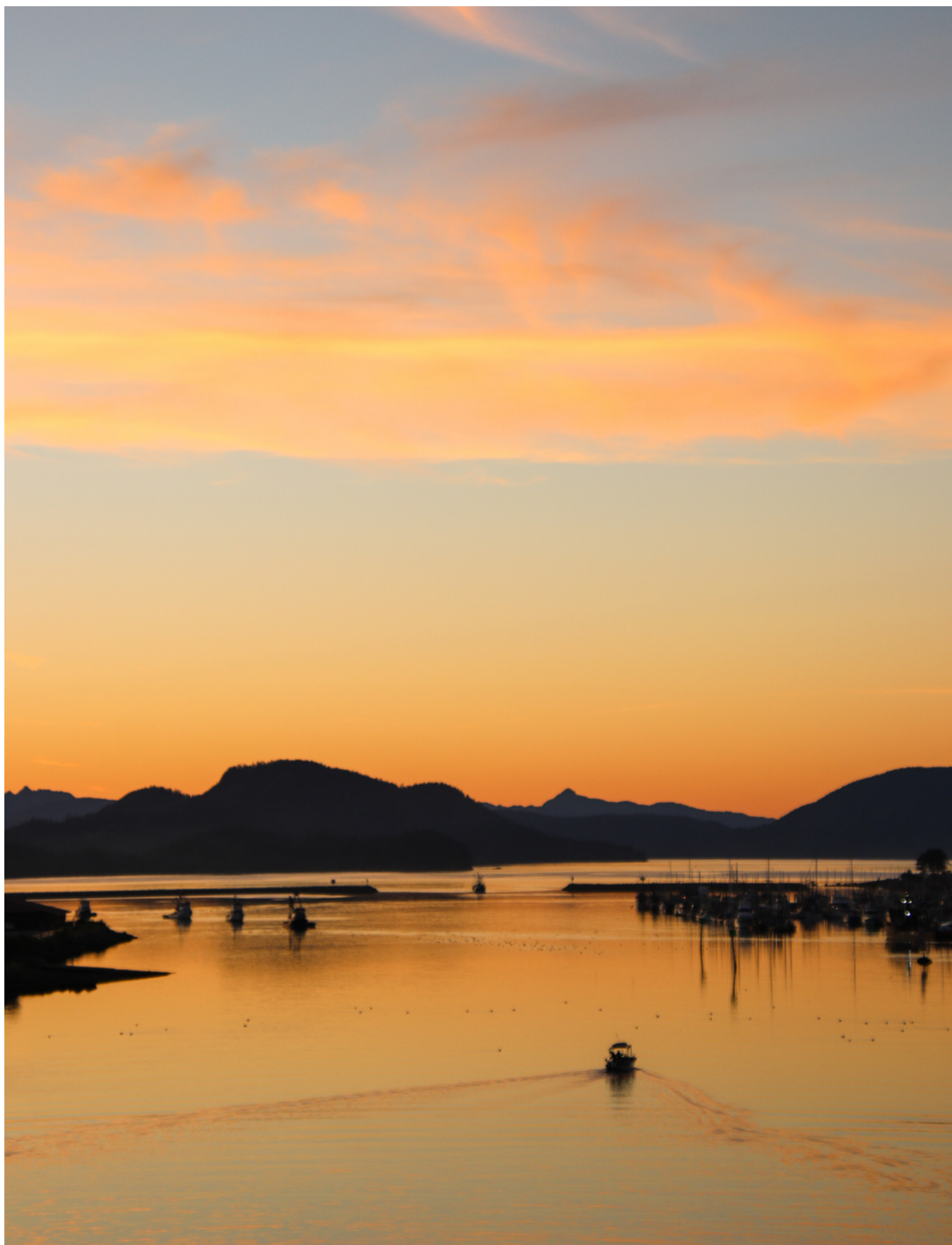
A classic O'Connell Bridge sunset over Sitka Sound.

Although we haven't been here long, we've already started hiking, growing, cooking, living, and working together; and we're looking forward to leaving our own, slightly muddy, shoes, for the next cohort to fill.