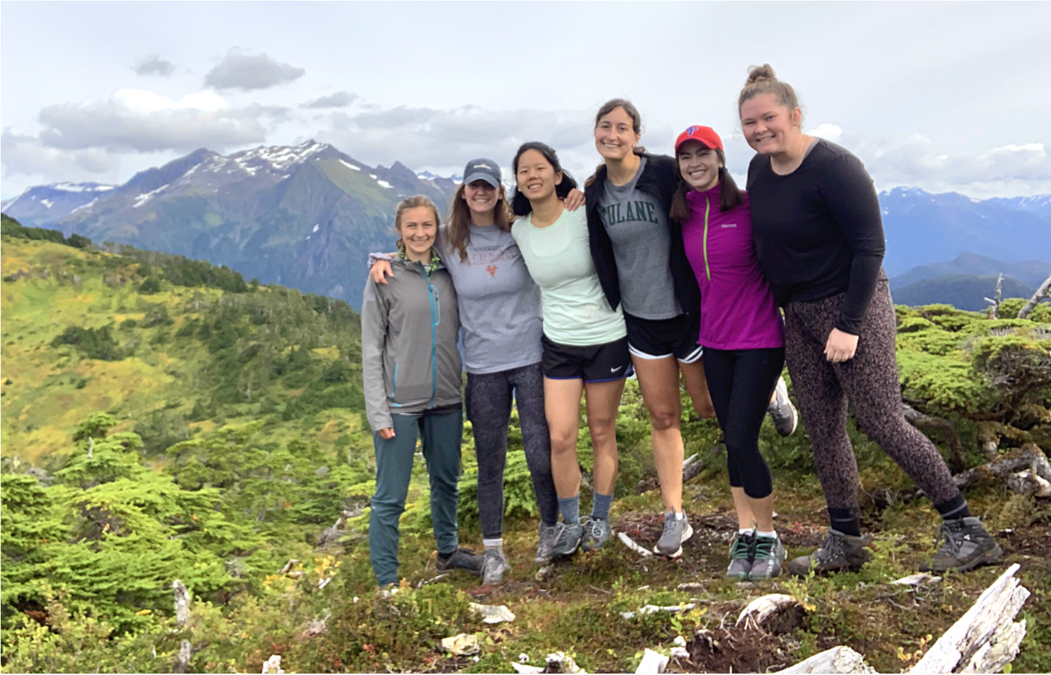
Fellows hiked the Mount Verstovia trail on a beautiful September day.