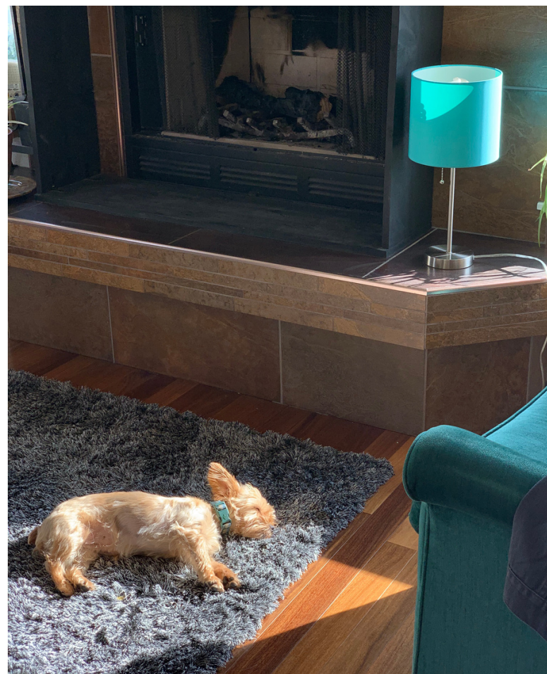
Penny naps in the sun at Virginia Ct.