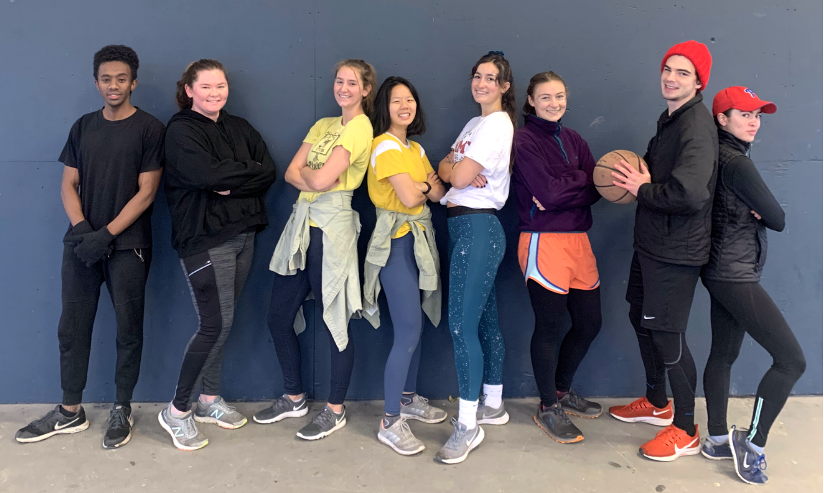
The inaugural 700 Etolin Field Day took place on a rainy Sunday morning. Fellows competed in basketball, four square, a dance-off, and soccer. Semaite and Grace came out victorious.