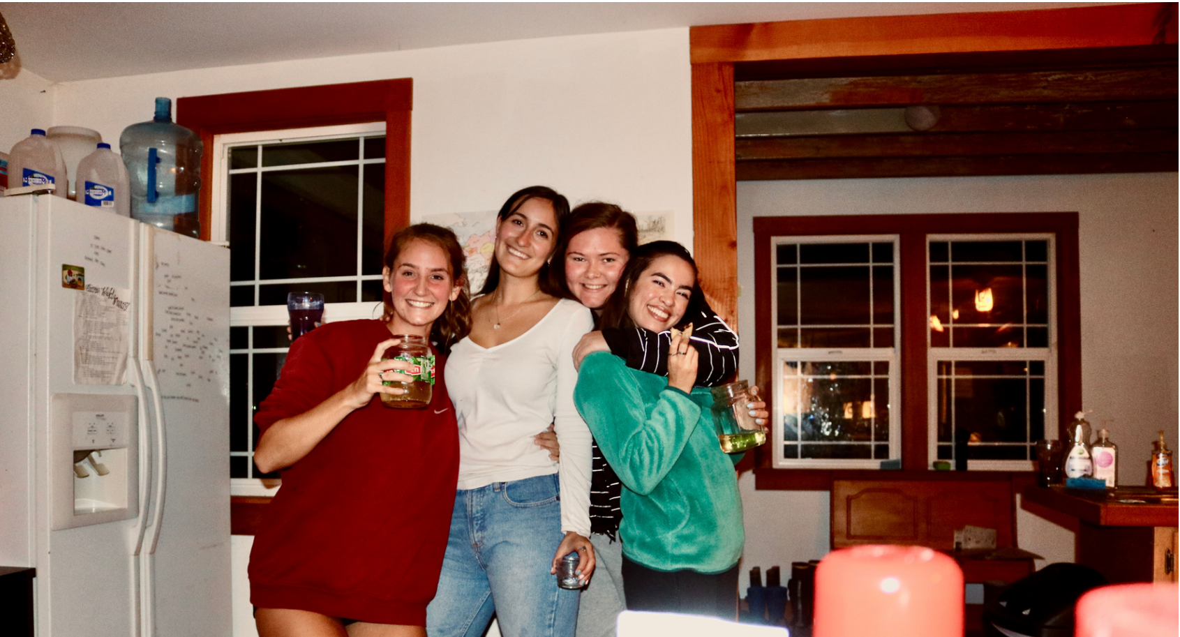
Fellows enjoy an impromptu dance party at 700 Etolin.