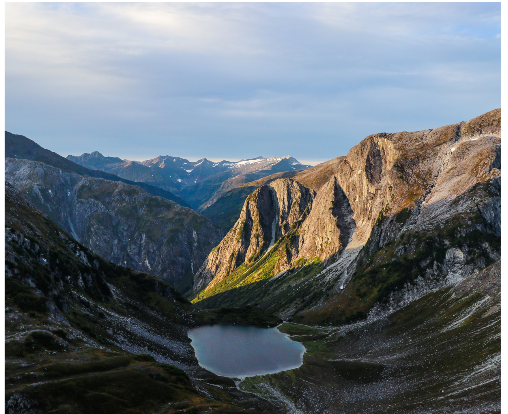
Little Indigo Lake during late afternoon.

Some of us have lived in Alaska our entire lives. Some of us are newcomers to the state. Some of us want to stay in the state forever, while others hope to have a memorable experience before heading elsewhere. Although we all have different backgrounds, we are united by a desire to develop personally, grow professionally, and enrich our Alaska communities.